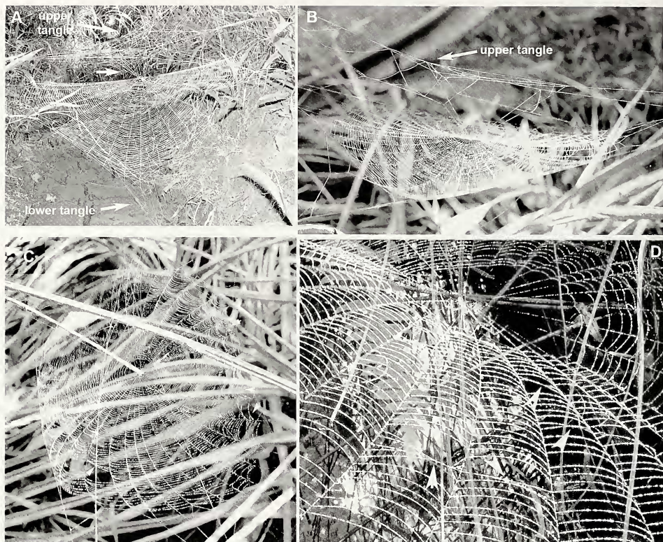
Figure 1.—Web characteristics of young Leucage argyra . A. Web of a small spiderling with relatively dense tangle and numerous threads connecting the tangle to the hub of the orb web below. Part of the lower tangle with some threads attached to the substrate below is shown. B. Web of an older instar spiderling with a reduced tangle and few threads connecting the tangle to the hub of the orb web below. C. Web with radii and spiral threads deformed by a weak breeze in the field. D. Section of a spiderling web showing some spiral threads collapsed (white arrows).

Webs of L. argyra show clear ontogenetic changes. Adult females spin typical orb webs in horizontal planes ( 0-20^\circ ) without additional silk structures. They build them in open spaces, using exposed twigs and leaves on the herbaceous layer to attach the anchor threads. In contrast, early instar spiderlings (first instar out of the egg sac, recognized by their whitish abdomens, to possibly fourth instars, based on size) spin tangle structures above the horizontal orb webs (Figs. 1A, B). The tangle varies from a relatively dense, narrow tangle, to a few threads just a few mm above the orb. Several threads connect the hub to the tangle above. The tangle above the orb seems to be denser in younger spiderlings (Fig. 1A). In some webs, there is also a tangle of sparse threads that connect the web frame with the substrate below (Fig. 1A). Webs of early instars are constructed within dense herbaceous vegetation, often occupying small spaces among grass leaves.